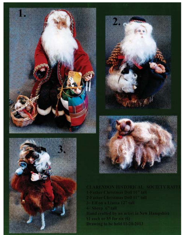
CLARENDON HISTORICAL SOCIETY RAFFLE 1- Father Christmas Doll 15" tall 2- Father Christmas Doll 11" tall 3- Llama or Llama 12" tall 4- Sheep 6" tall Hand crafted by an artist in New Hampshire $1 each or $5 for six (6) Drawing to be held 11-20-2013